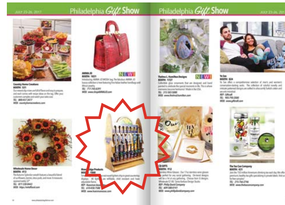
Your Product Shot Here