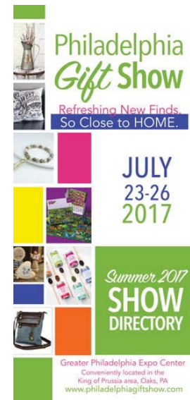
Show Directory Cover

The Philadelphia Gift Show directory is handed out on-site to all registered attendees featuring complete vendor information. In addition to seeing your ad at the show, buyers will refer to it after the show when they use the directory as a reference tool.