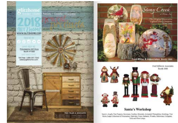
Your Product Preview Guide Ad Here