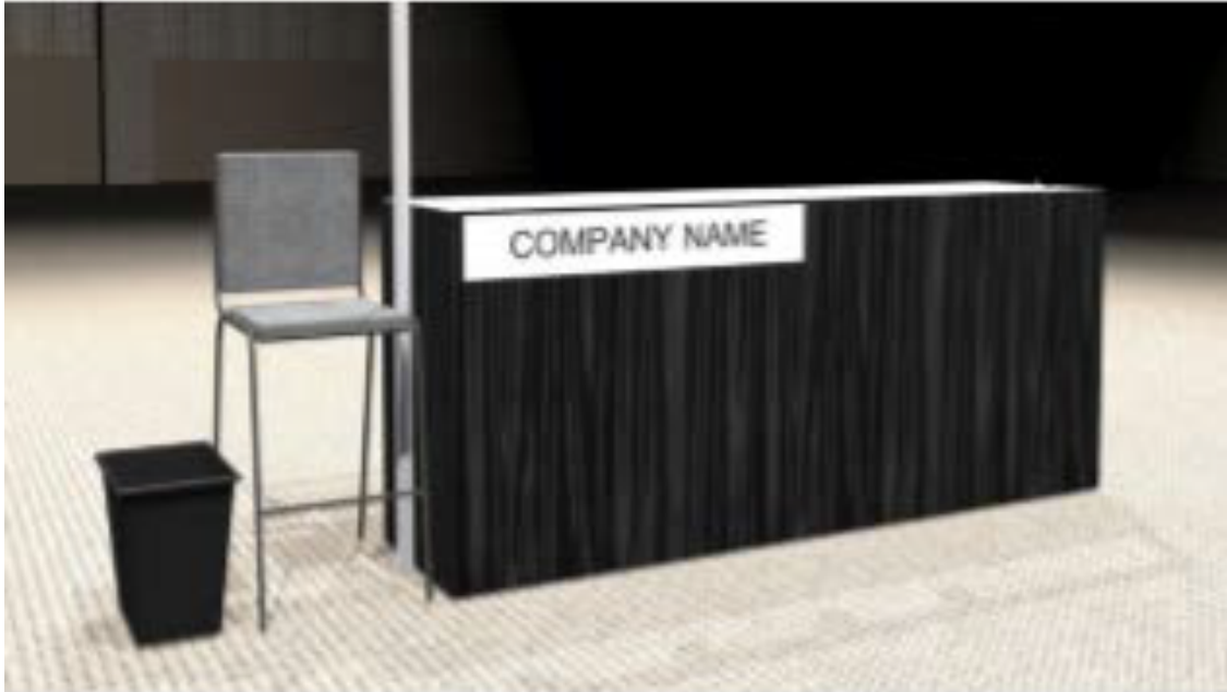
Table Top Package Includes: