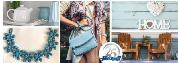
TABLE TOP GUIDELINES: