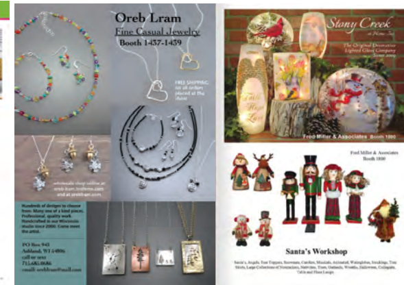
Your Product Preview Guide Ad Here