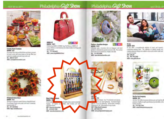
Your Product Shot Here