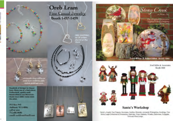
Your Product Preview Guide Ad Here