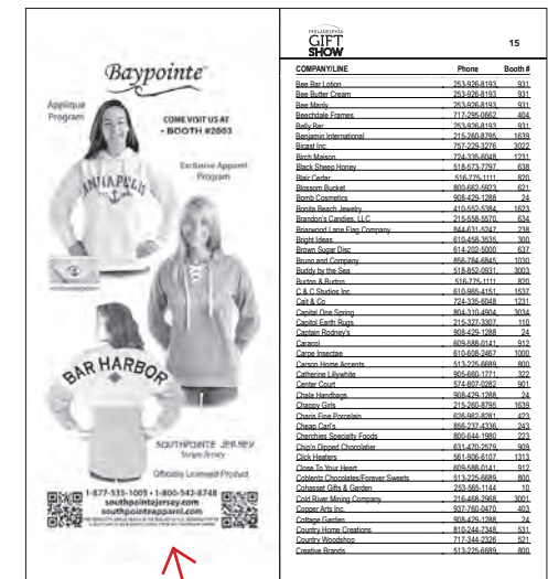
Your Pocket Guide Ad Here